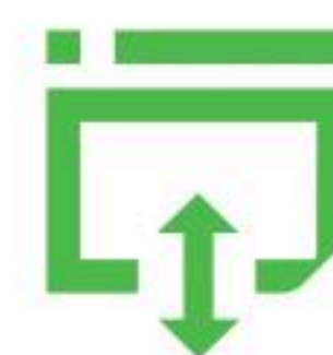
Kubernetes Application Mobility